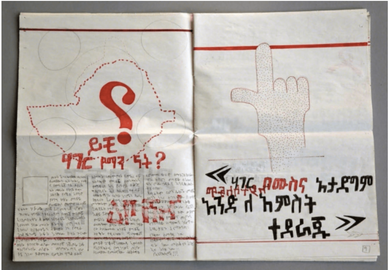
Robert Temesgen, Another Old News (2016), Courtesy of the artist and Tiwani Contemporary.

environmental activist Ken Saro-Wiwa. The inanimate object becomes something more than an empty relic: an exclusive witness of history, as effective in its role as a lively picture of Saro-Wiwa himself. The combination of the simple scan image of the pipe, which doesn't save any room for further comment, and the soundtrack that resonates with echoes of the past, opens an unexpected window on a precise historical narrative.