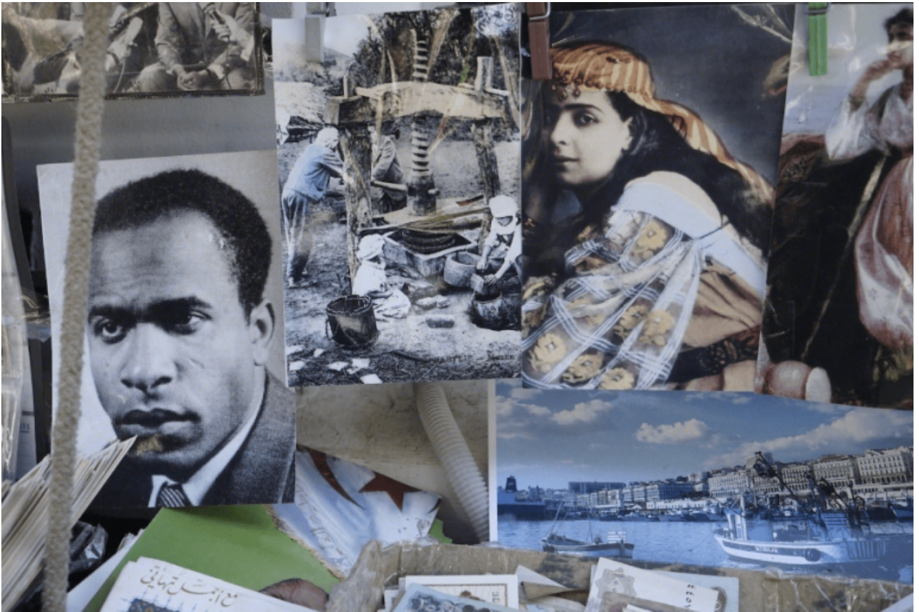
Katia Kameli, L'Oeil se noie (2016), Courtesy of the artist and Tiwani Contemporary.