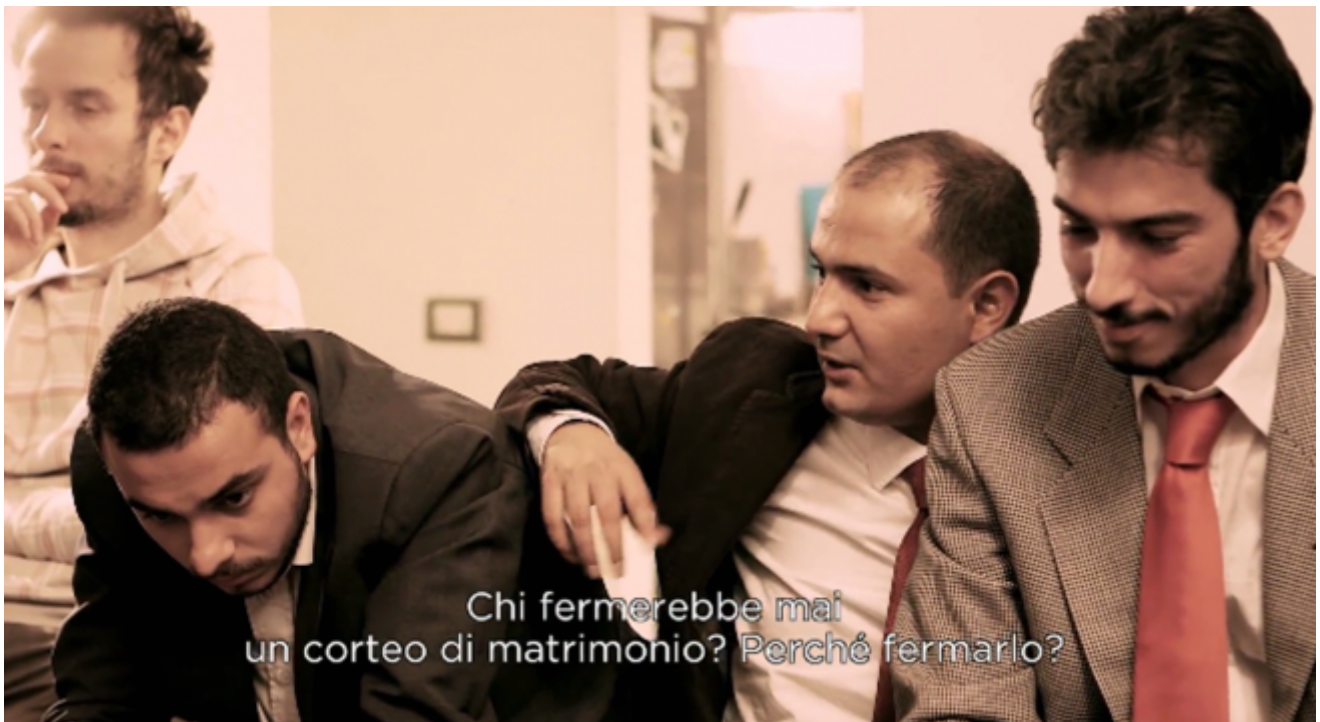
Io sto con la sposa (2014) , screenshot dal film.

What is the vision behind your work? What kind of change do you think you can bring about with your films on migration?