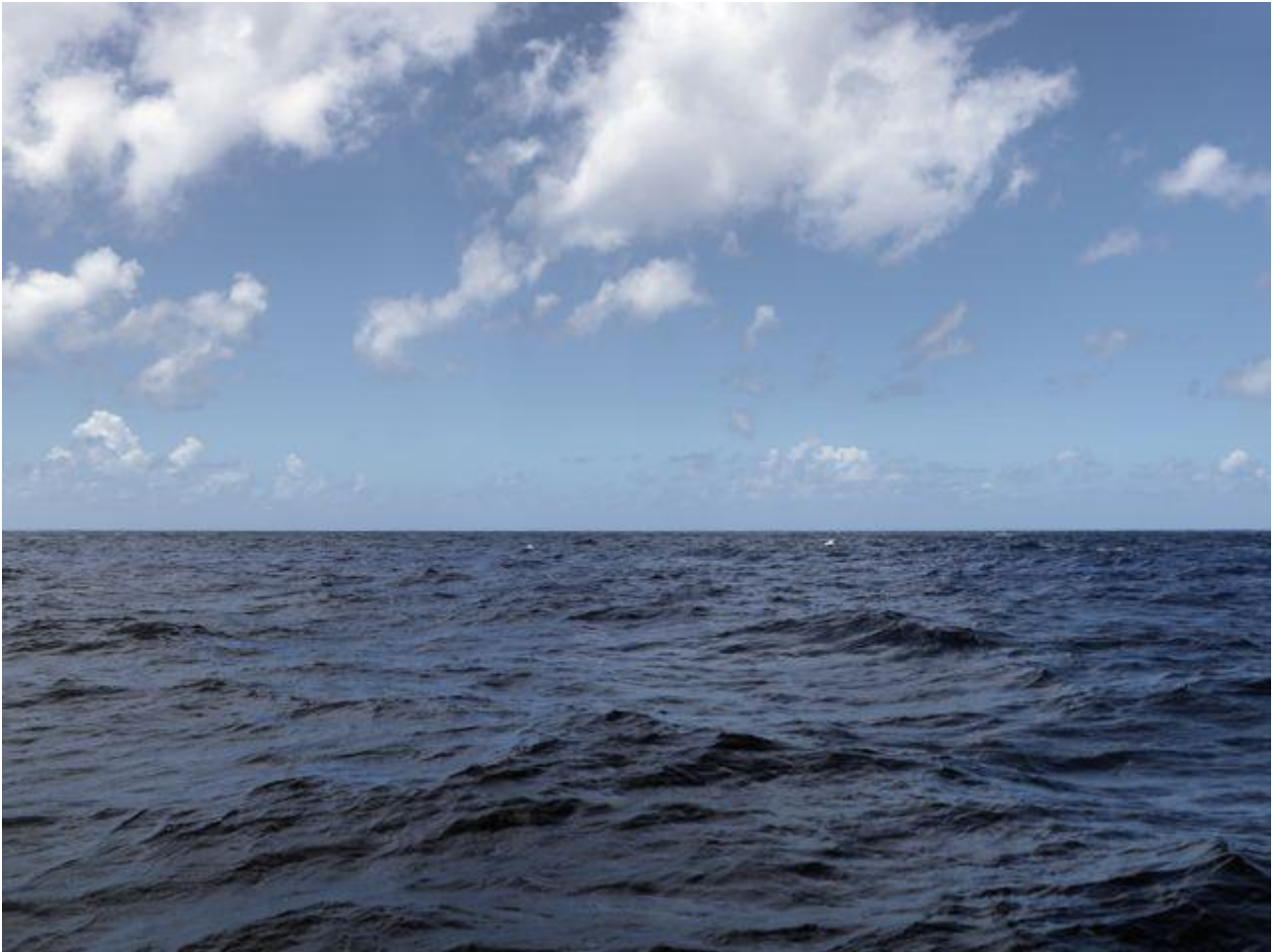
Guy Tillim, Near Huahine , 2011

me speaks through me, or at least I should aspire to this state. The invisibility of self is desirable in what is mediated.