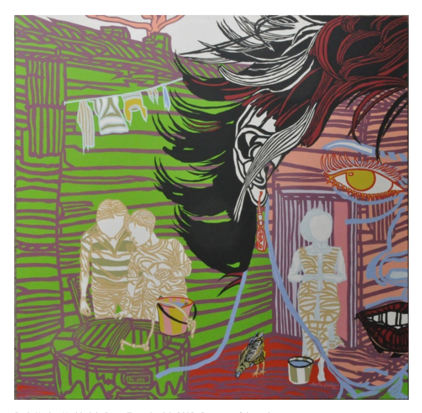
Boris Nzebo, Untitled, in Down Town (serie), 2013. Courtesy of the artist

So I stopped looking at these issues of identity: who I am, who is and is not African, and what we all have to do with each other. As soon as I stopped this restrictive search for myself, I was able to look Africa in the eye.