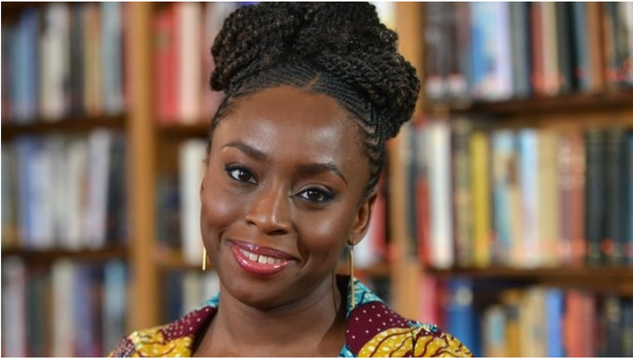
Chimamanda Ngozi Adichie

Americanah has won the National Book Critics Circle Award and many other prizes, including being listed in the New York Times' Ten Best Books of 2013.