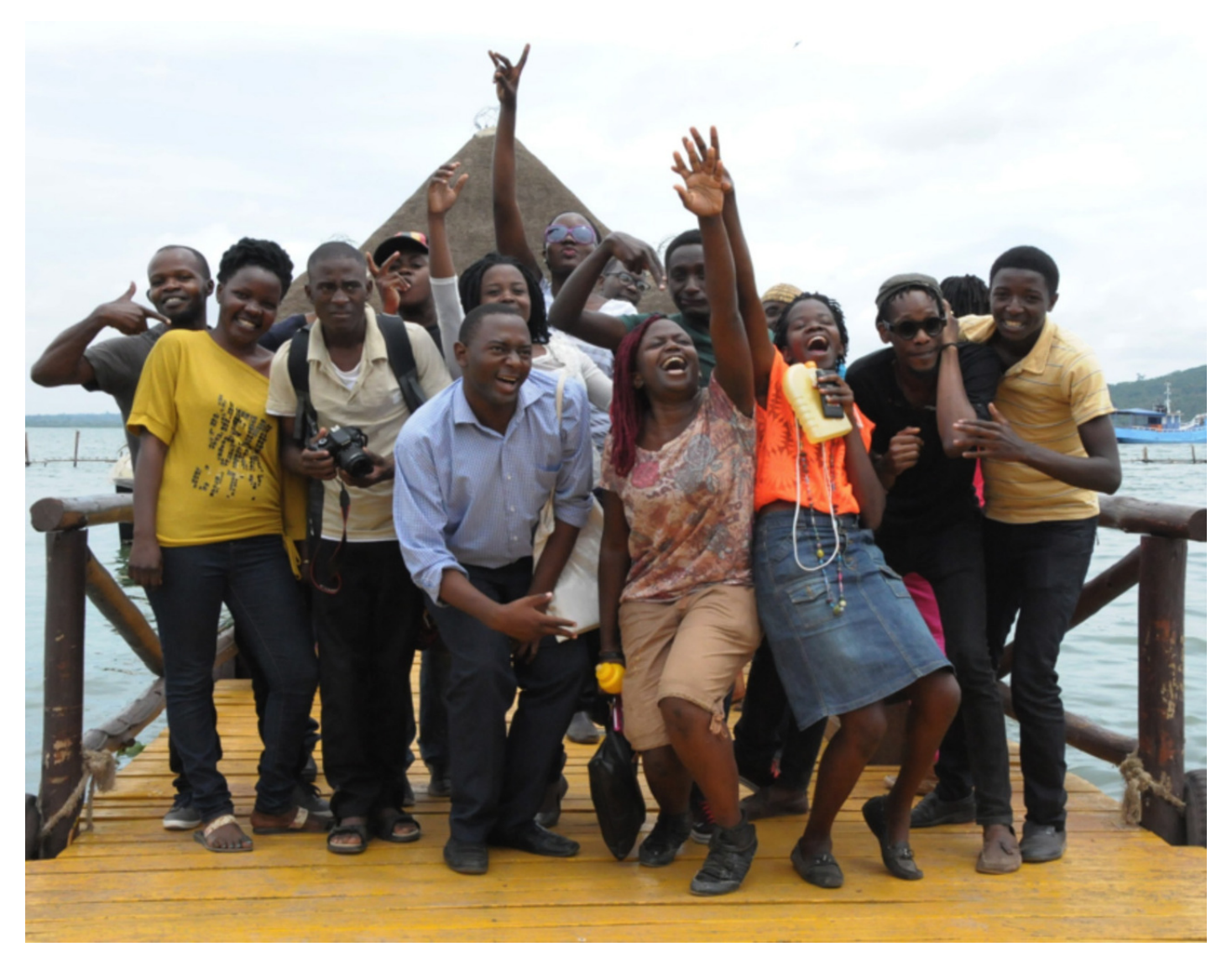
AtWork Kampala participants, photo by Solomon Okurut.