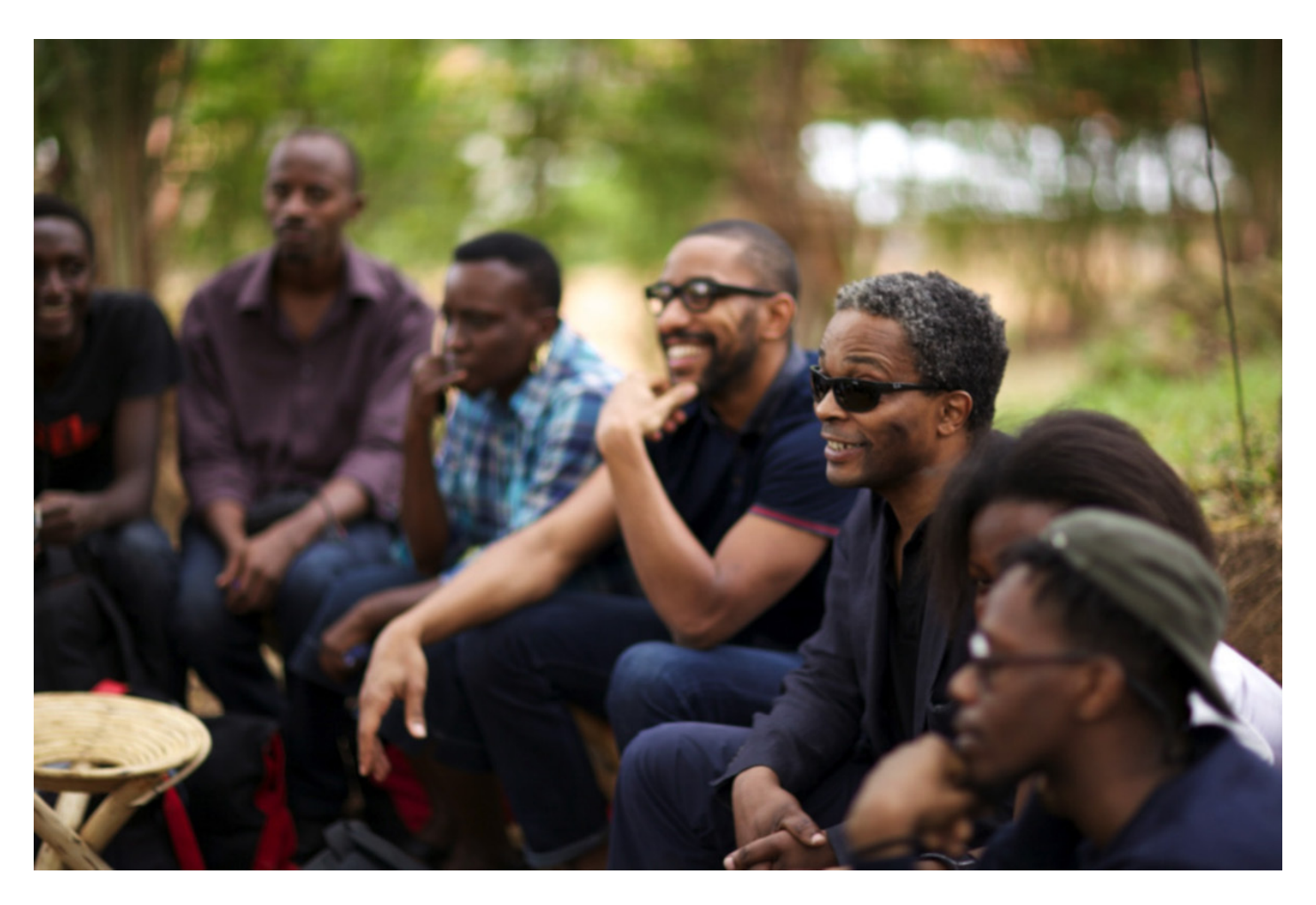
AtWork Kampala, photo by Solomon Okurut.

universities and other schools, but to something more organic, which in ancient times was transmitted by word of mouth in the rituals where the origin of the universe was revealed to us. It encompasses a whole lot of secrets that a university is unable to share, such as the art of bricolage . In 1891, while universities in the United States were about to reach a turning point that made them become what they are today, American philosopher Peirce defined university as "an association of men [...] endowed and [...] privileged by the state in order that the people may receive intellectual guidance, and that the theoretical problems which present themselves in the development of civilization may be resolved." This statement clearly reveals the vanity of Peirce's philosophy. If we look at our world, we can see that its theoretical problems, far from being resolved, have become more complex and inextricable; as if, instead of solving them, we only made them worse.