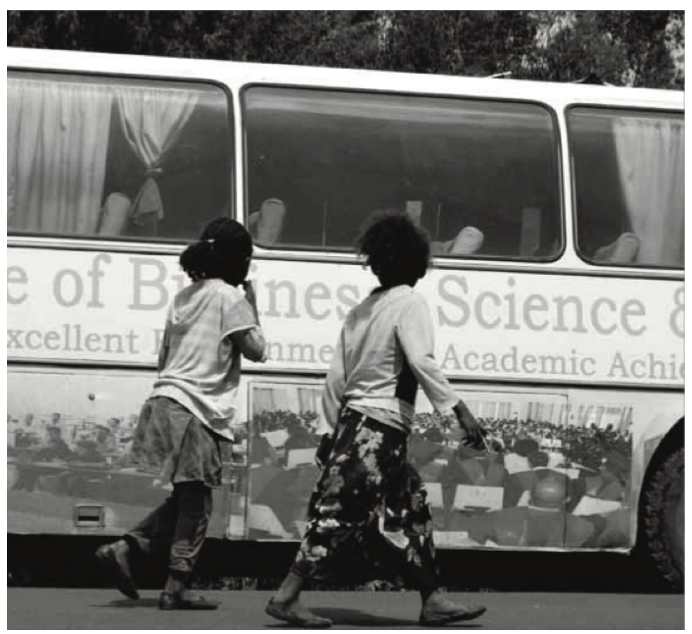
Distances by Hymanot Honelgn.

Why 'distance'? "From a formal point of view, distance is a measure and the result of a process that, in order to be determined, needs conventions, tools and calculations," explains Marco Milan, creator and curator of Tales-on . "But not all distances are necessarily measurable or quantifiable.