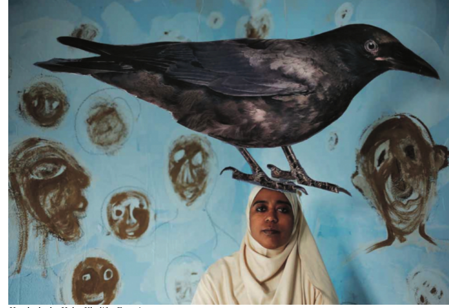
Headache by Heba Khalifa, Egyptian.

It is a risk inherent in every story, but especially in that of photography: the misappropriation of another's life, pain and suffering. The assumption of our own point of view and interpretation as an objectifying lens: here then our pain is attributed to someone else, our wonder sewn onto an anonymous face, which becomes public and is used for a particular message.