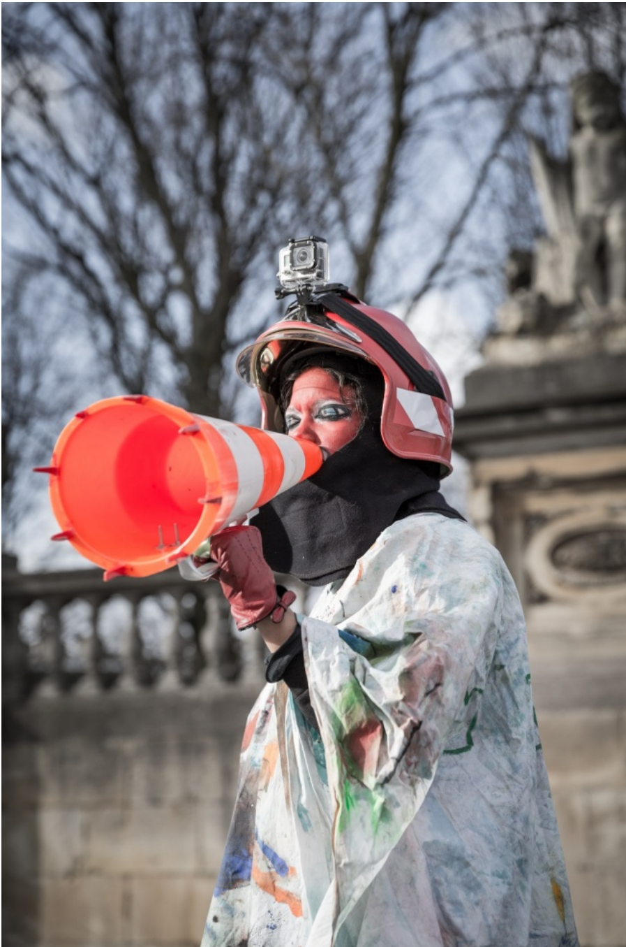
Tracey Rose, Tracings, 2015

Intense, cutting, provocative and highly political, this exhibition curated by Koyo Kouoh at Wiels in Brussels showcases the work of a generation of female artists from various regions of Africa who were trained in the late 90s, twenty years after post-colonial studies and the radical body-art performances of the 1970s, when the issues of feminism, gender and sexuality were being revisited and questioned by contemporary art practices. It no longer brings out the emotion, expression and “passion” of the Western body – the symbol of a century of turmoil, restlessness, atrocities, desires and madness – but focuses on the warmth, memory and sensitivity of the 2000s African body, with its multiple identities, vulnerability, stories and rebellions. Unlike Western countries, the public exhibition of the naked female body as a means to point out social injustices is still a deeply rooted practice in traditional African culture.