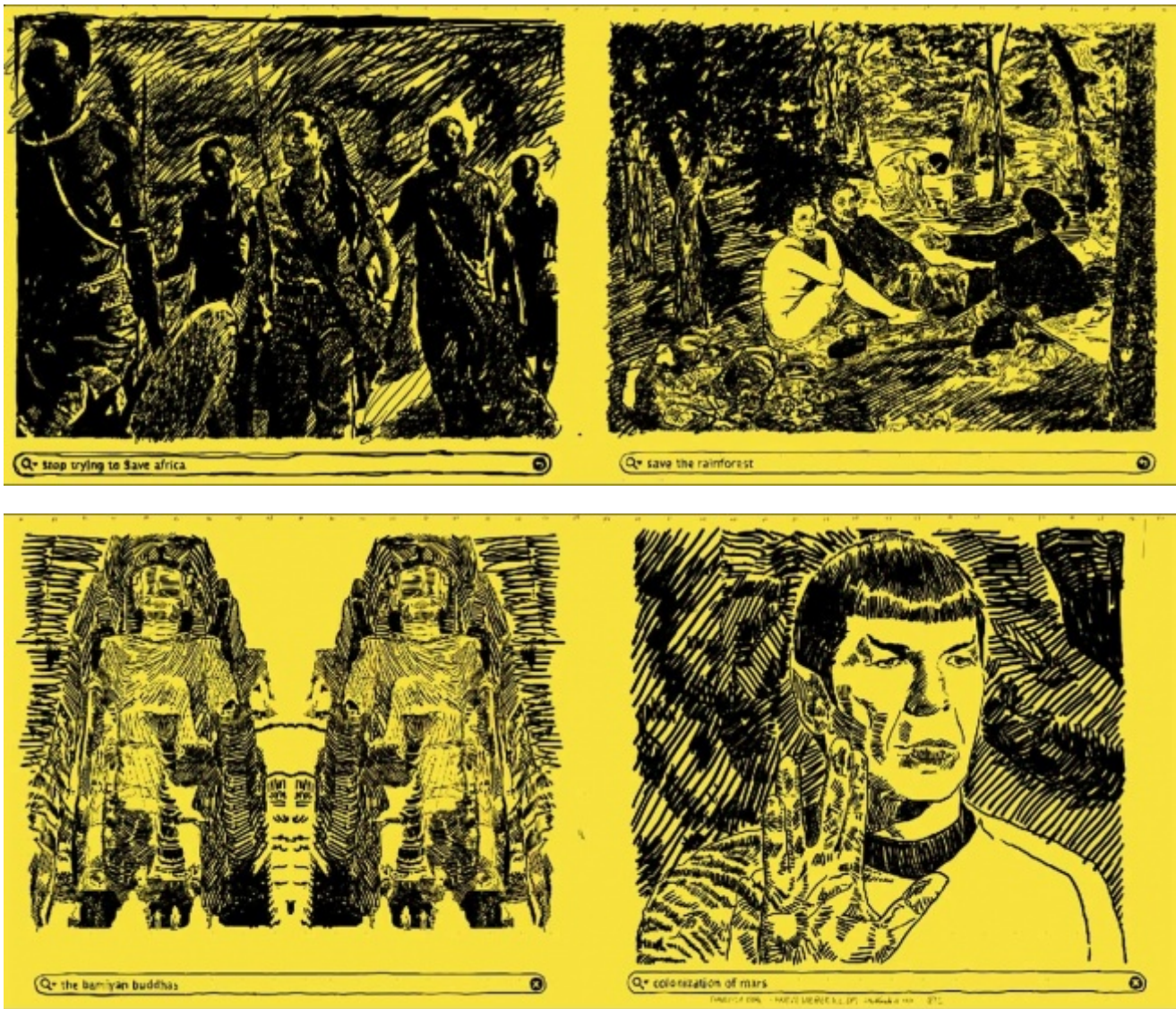
Francisco Vidal. Post-it series, 2010.

Despite the infancy of these projects, events like these do serve to reinforce, as RitaGT alludes to in our interview , that the general sentiment is that in Angola, “potential is not lacking.” And, as the architects of emerging discourse, it is hoped that the success of these critical young artists-locally and further abroad-will translate into tangible local initiatives that lead to vitality, increased cultural awareness, and potentially, local institutional support for the arts.