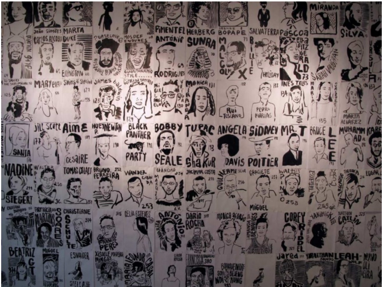
Francisco Vidal. Installation view.

Vidal operates a multi-disciplinary practice that includes drawing, sculpture and installation as a means to reflect upon the reality in which he lives. He has a vested interest in exploring notions of race, difference, negritude and the African Diaspora.