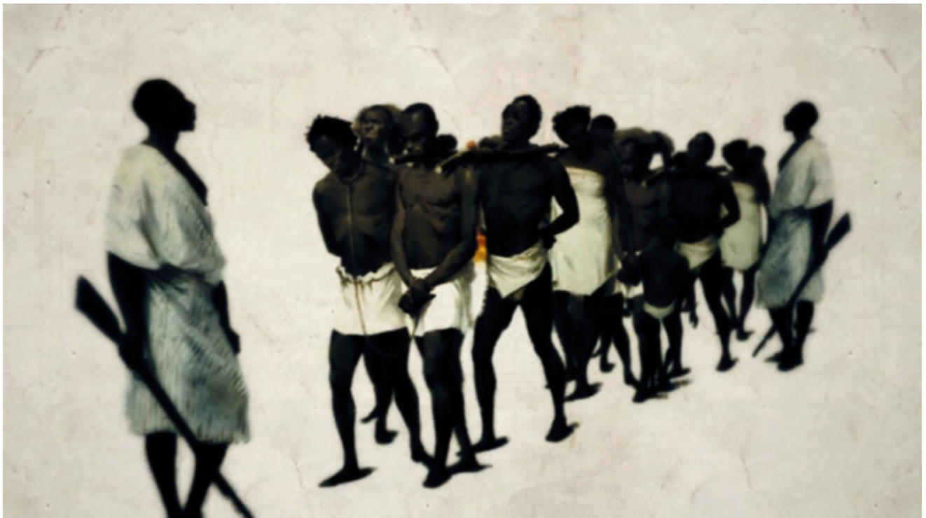
Bofa Da Cara, My African Mind , 2010, screenshot from the video, 6'11".

Looking back over the 20 th century, it seems that the predominant story concerning the continent of Africa is an imagined one. From explorers to missionaries, from colonizers to reporters, the record of Africa (and by record, I mean the way that Western minds are accustomed to charting history: books, journals, newspapers, archives, etc.) was written, photographed, and performed by outsiders. Bofa da Cara (Pere Ortín & Nástio Mosquito) captured this historic monopoly on defining the “Dark Continent” in their video montage, My African Mind (2010).