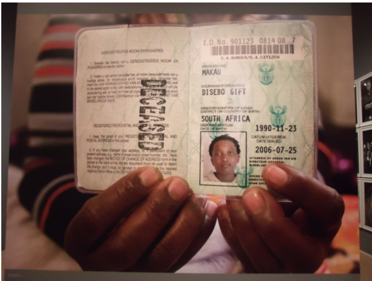
Installation of Zanele Muholi's Isibonelo/Evidence at The Brooklyn Museum exhibit, 2015.

While art circles have made strides in representing and exhibiting artists of African descent—from an increasing number of solo shows (Ibrahim El-Salahi at Tate Modern, El Hadji Sy at Weltkulturen Museum, or Zanele Muholi at The Brooklyn Museum), to Africa’s prolific presence at biennials worldwide (including the landmark participation in Okwui Enwezor’s All the World’s Futures for the 2015 Venice Biennale)—there remains a group of people for whom Africa is still an imaginary place.