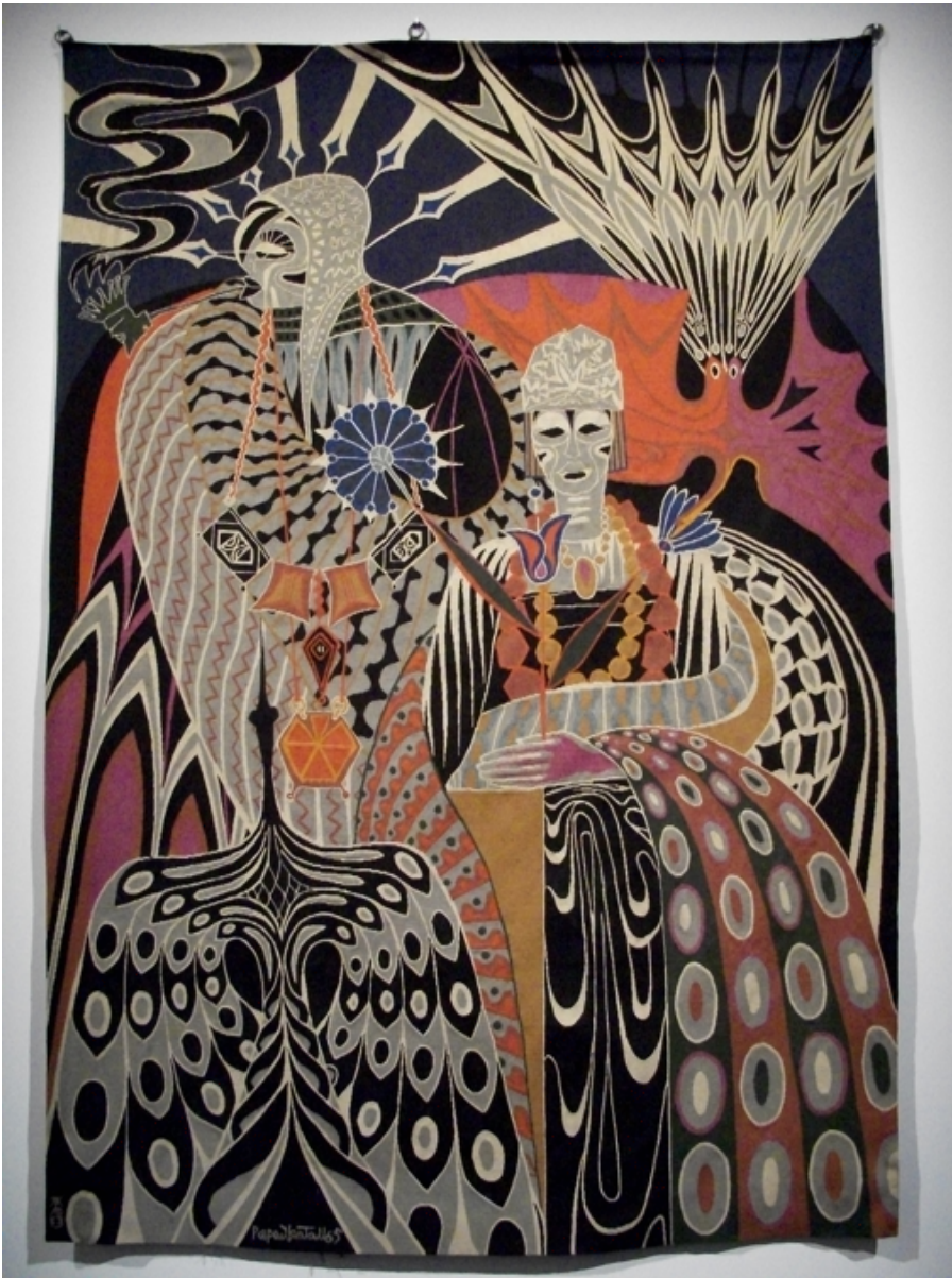
Papa Ibra Tall, Royal Couple, 1965, acrylic on board.

the Dogon. We can learn of Ezrom Legae's powerful abstracted sculpture during Apartheid, or of Papa Ibra Tall and Iba N'Diaye's contributions to African Modernism and the École de Dakar, or of Chéri Samba's groundbreaking presence at the Centre Georges Pompidou in 1989. We would no longer be surprised at the presence of new media—digital, video, sound—in the oeuvre of African artists.