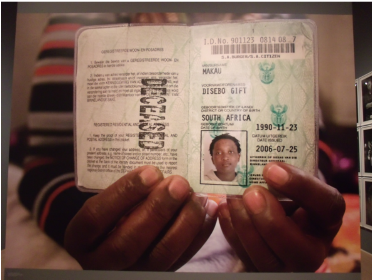
Installation of Zanele Muholi's Isibonelo/Evidence at The Brooklyn Museum exhibit, 2015.

While art circles have made strides in representing and exhibiting artists of African descent—from an increasing number of solo shows (Ibrahim El-Salahi at Tate Modern, El Hadji Sy at Weltkulturen Museum, or Zanele Muholi at The Brooklyn Museum), to Africa’s prolific presence at biennials worldwide (including the landmark participation in Okwui Enwezor’s All the World’s Futures for the 2015 Venice Biennale)—there remains a group of people for whom Africa is still an imaginary place.